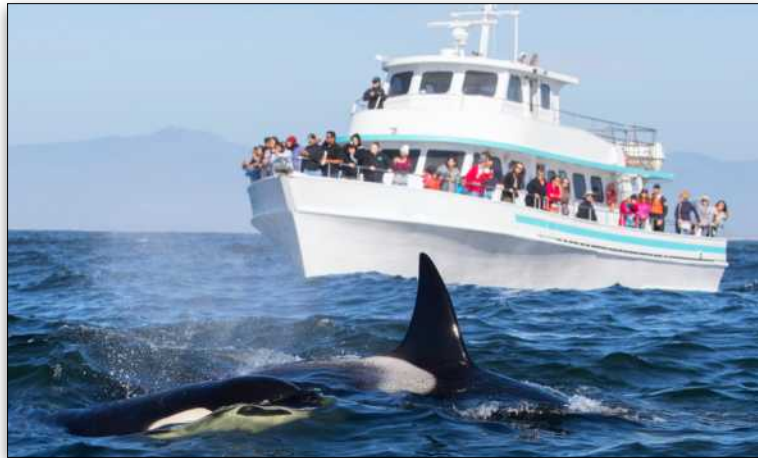
Whale watching, a truly west coast adventure