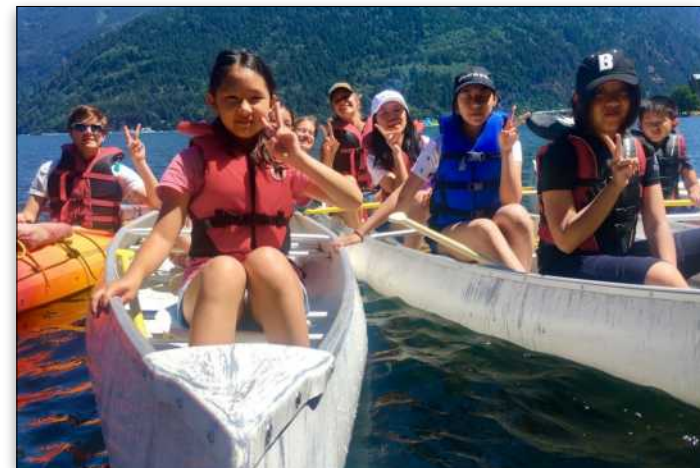
Camp Day 2 afternoon activity: canoeing!