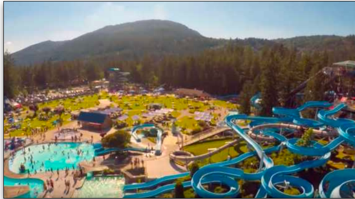
Cultus Lake Waterpark is the biggest in the province!