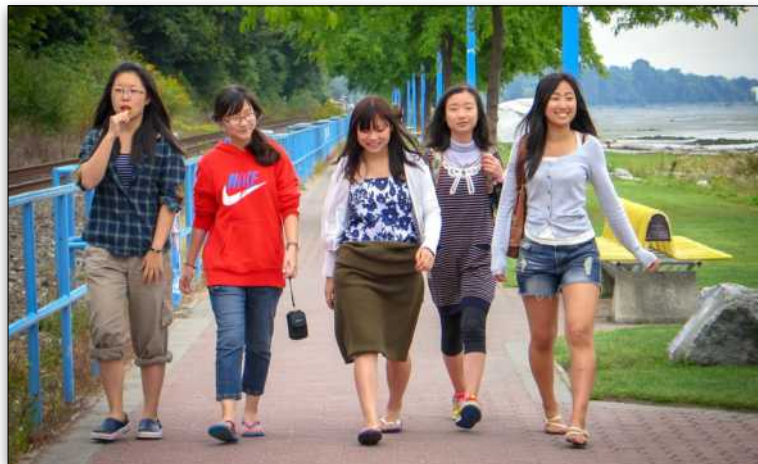
Walking along Vancouver's Sea Wall

time. After lunch, everyone will shuttle to beautiful Harrison Lake for an afternoon of fun. Games will be enjoyed on the lakeside sandy beach, as well as opportunity for learning about watercraft safety before experiencing paddling in canoes and kayaks. This is often the first time for many students and a very memorable activity of their summer trip. Today's full day of activities creates a big appetite for students to take home to their host family for dinner time!