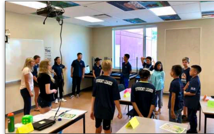
Interactive classroom time with local students

Students will head off for another full day of school interactions and cultural activities. ESL class and activities will be in the morning, as well as discussion and personal sharing between the students and the local kids around holidays and hobbies. Some games will be enjoyed outside before lunch