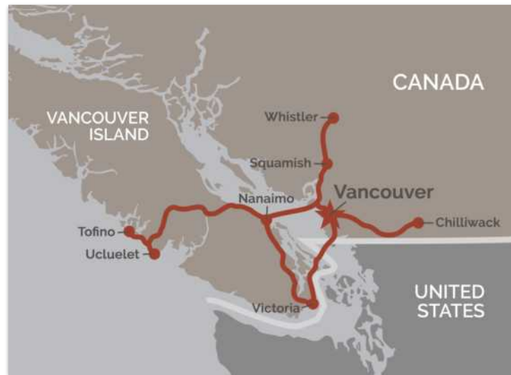
This 14 day trip shows off the best of the West Coast

hospitality, and display the kind of genuine friendliness that is difficult to find in big cities. During the camp students will stay in the warm hospitality of local homes for six nights.