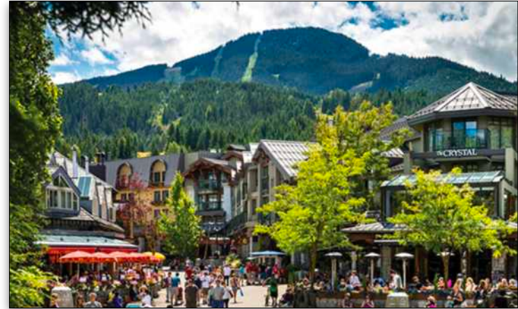
Whistler village in the summer