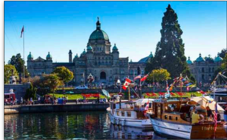
Parliament Buildings in Victoria, BC

Wake up early to a hot Canadian breakfast at home before heading to one of Canada's most famous destinations: