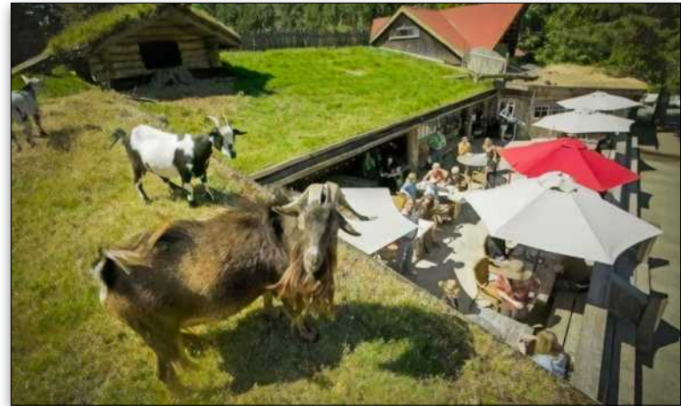
Goats on the Roof at Coombs Country Market

Learn to fish this morning! Begin the day with an early breakfast, and head out on the quiet morning water by 7am like the locals. Your fishing charter boat and captain are local experts on safety, sea life, and where to find the fish. Experience the thrill of having a live fish on your line while you reel it in! Return to Tofino Harbor for lunch, before taking your