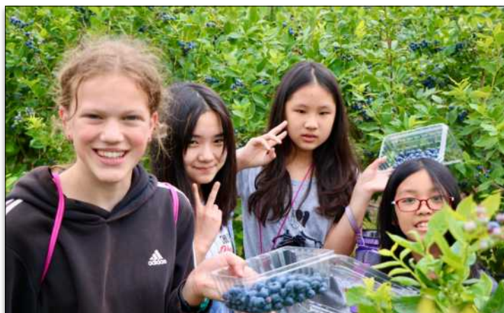
Camp Day 1 afternoon activity: picking blueberries!