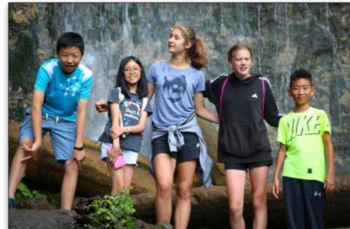
Afternoon hike to Bridal Falls