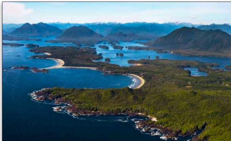
Tofino & Ucluelet: Canada's real west coast!

very own catch to learn about how to prepare a west coast delicacy: smoked salmon. After only 3 hours in the smoker, you can take your fish home to enjoy! Return to Ucluelet in the afternoon for a walk along the Wild Pacific Trail to the lighthouse for views of the west coast waves crashing on the rocks. Dinner will be enjoyed in the village, before heading down to the marina to view some of these large fishing boats up close and perhaps see local fishermen bringing in their catch! Enjoy an evening group activity before writing about your day in your journal.