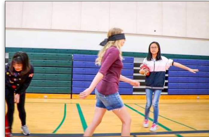
Interactive games help the ESL learning experience