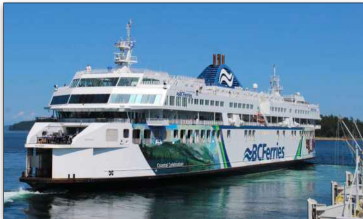
Riding on BC Ferries is a highlight for everyone!