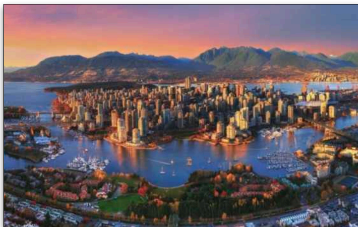
Welcome to Vancouver!