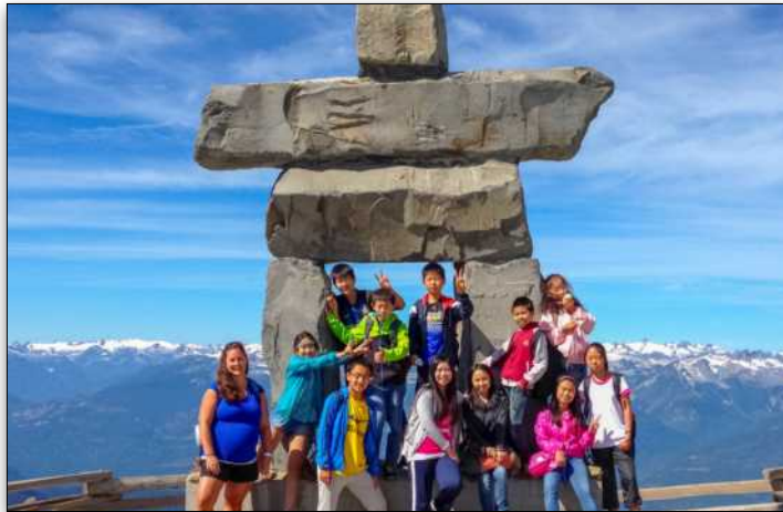
Sizing up an Inuksuk at Whistler