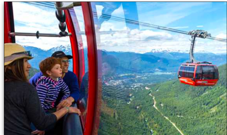
Views from the Sea to Sky Gondola in Whistler