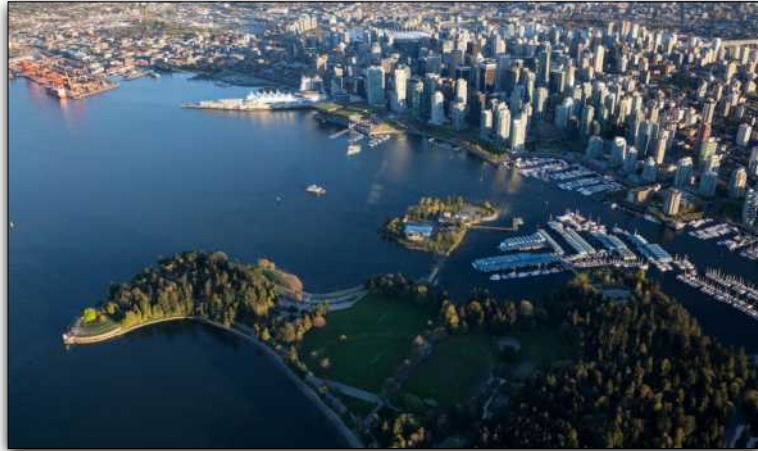
Stanley Park & Downtown Vancouver