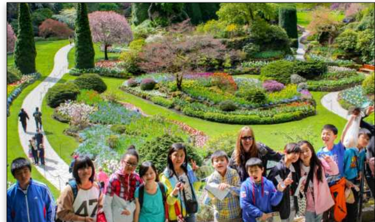
Surrounded by the beauty of Butchart Gardens