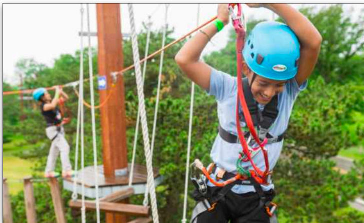
Testing your limits at Wild Play Element Park

Butchart Gardens. The dazzling beauty that draws people from around the world has to be seen to believe it. Enjoy a seafood lunch down at Ogden Point, followed by a walk out to the lighthouse along the breakwater for views of First Nations murals. In the afternoon climb aboard a horse-drawn carriage for a ride through downtown Victoria. Time for shopping along the cobble stones of Victoria's historical Government Street for Vancouver Island souvenirs is a must before dinner in China Town. Following dinner, the evening will be spent on a Tall Mast Sailing Ship cruise through Victoria Harbor! Return home in the evening for a snack and time for writing in your journal.