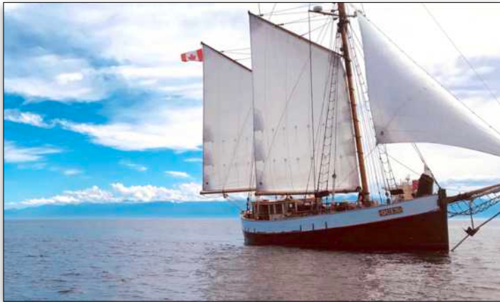
Enjoy an evening sail on a Tall Mast ship